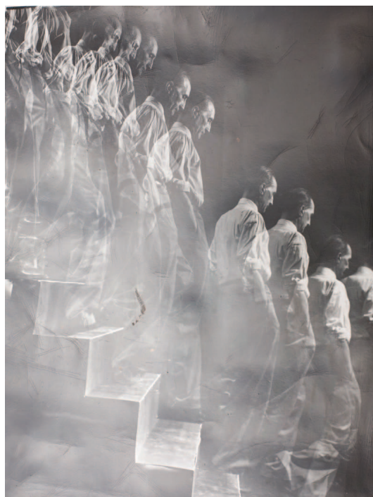
Oblique spectral photograph of the print surface, used to detect cracks and distortions.

of loss unobtrusive. I reattached the labels on the back with wheat starch paste. Looking back at my work, I could see subtle changes—old adhesive replaced by easily removable wheat starch paste; new watercolor inpainting in place of Spotone and older inpainting; and a print that now lay flat. I had left my own marks embedded in the surfaces of these photographs.