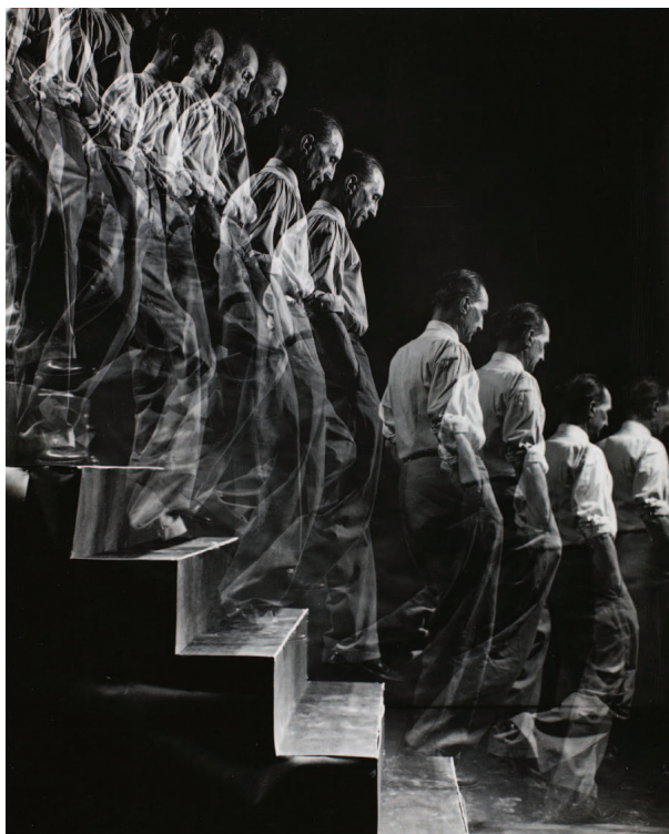
Eliot Elisofon, Marcel Duchamp Descends a Staircase , 1952: the working print, after treatment.